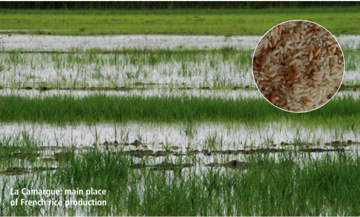
La Camargue: main place of French rice production