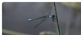
dragonfly (Lestes macrostigma)