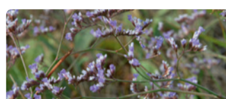
Sea lavender (Limonium narbonense)