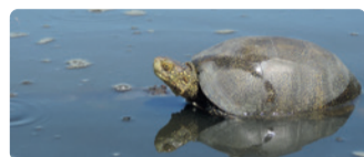
Pond turtle (Emys orbicularis)