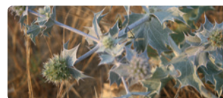
Chardon des sables (Eryngium maritimum)