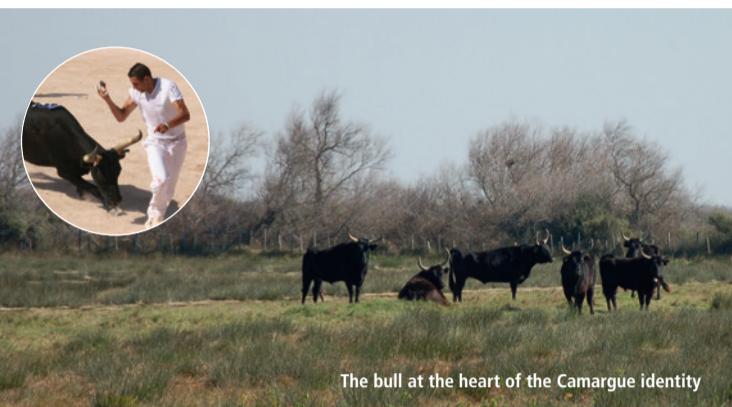
The bull at the heart of the Camargue identity