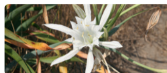
Sea daffodil (Pancratium maritimum)