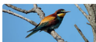
Guépier d'Europe (Merops apiaster)