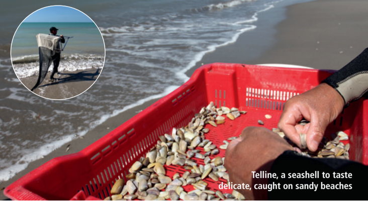
Telline, a seashell to taste delicate, caught on sandy beaches